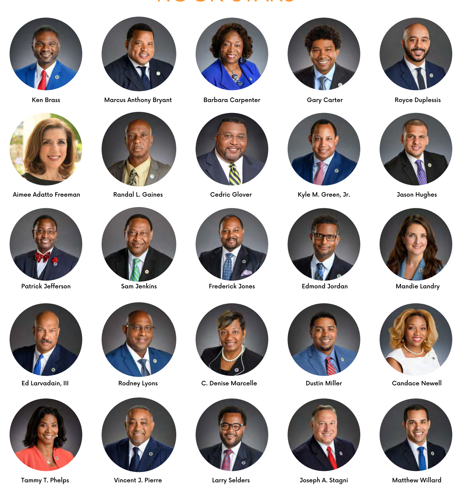
Representatives scoring 100% and were present more than half the votes during the regular session, were present during the veto session, and did not vote for SB 156 during the regular session were recognized as Rock STARs.