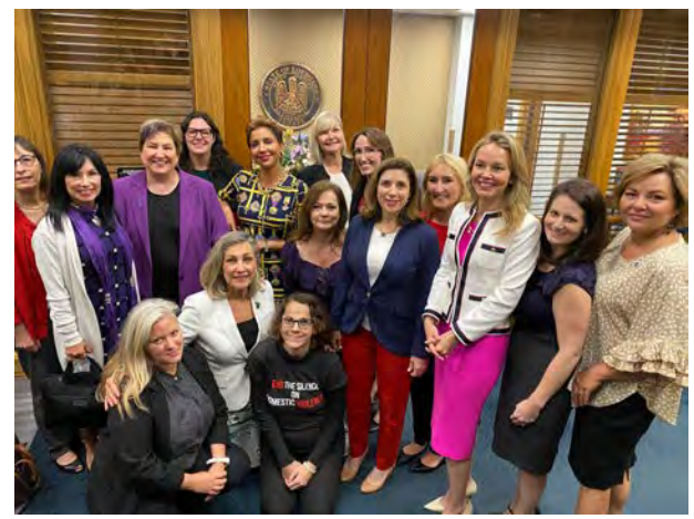
Advocates after testimony on HB 55 in Senate Judiciary A.