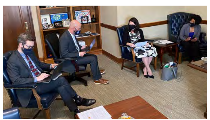
STAR staff meeting with the Governor's staff to discuss our legislative agenda.