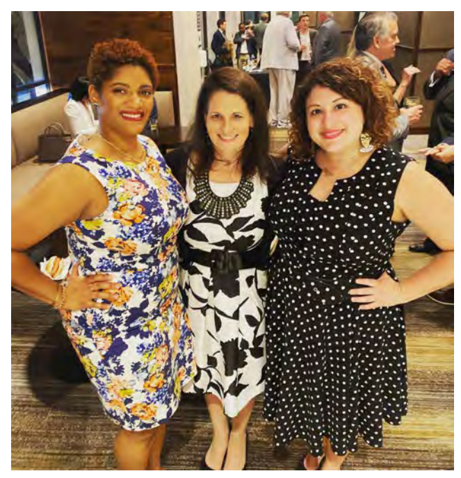
STAR staff celebrating our legislative victories.