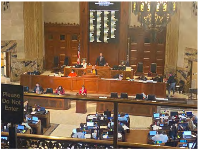
Representative Aimee Freeman presenting HB 409 to the House of Representatives.