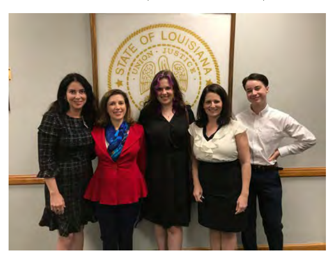
Advocates after testimony on HB 375 in Senate Judiciary A.